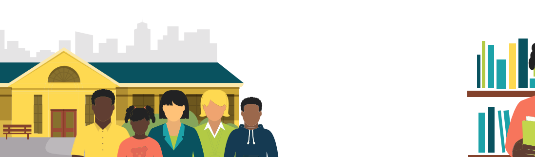
MPL is an anchor institution that helps build healthy families and vibrant neighborhoods—the foundation of a strong Milwaukee.

LED BY OUR VISION AND MISSION, MPL will reach our goals outlined in the 2020 strategic plan.