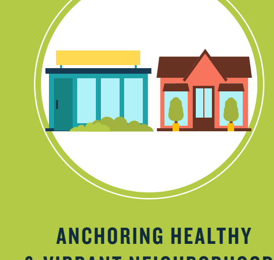
& VIBRANT NEIGHBORHOODS